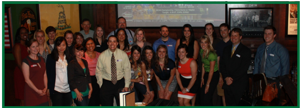
MSPH and MHA alumni, faculty, and current students at the PHS Alumni Networking Event at Black-Finn Saloon during National Public Health Week, co-sponsored by GPHA and CHESO.

The UNC Charlotte Beta Phi chapter of Delta Omega, the National Public Health Honor Society, held new member inductions during National Public Health Week. Three student members, four alumni members, and one honorary member were inducted.